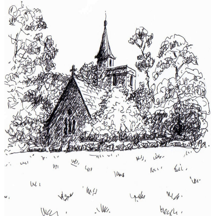
St Mary the Virgin, Kingston Deverill